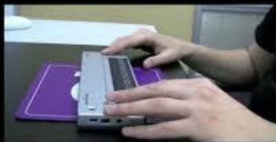
Refreshable Braille Display