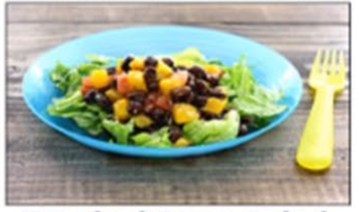
Tropical Bean Salad

The 40 recipes in this Team Nutrition collection will add the flavors from different cultures and regions to menus.