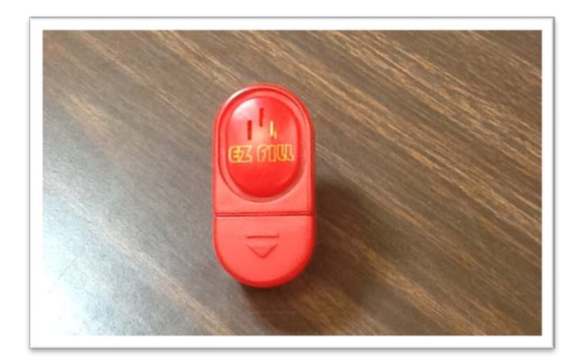
EZ Fill - Device that buzzes to indicate that a liquid has reached about 1 inch from the top of a container.