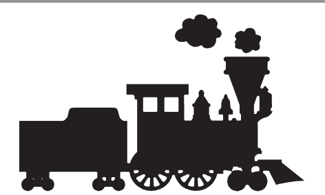
You may be the engine that helps a family to get over that mountain.

4. Don't surrender. It can be easy to ignore the values of the familycentered meeting process, especially in those "hot" meetings or when you have strong personalities at the table. DON'T. Your primary role as a facilita-