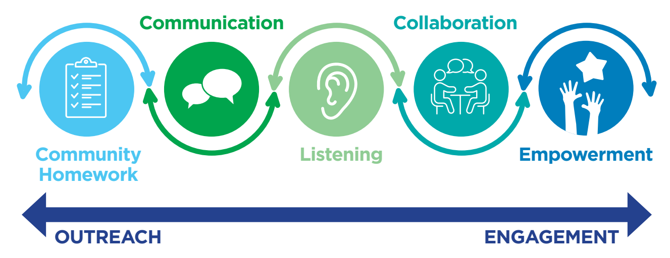
Figure 2 - Equitable Outreach and Engagement Continuum

This Continuum is created by the NCDHHS Office of Health Equity.