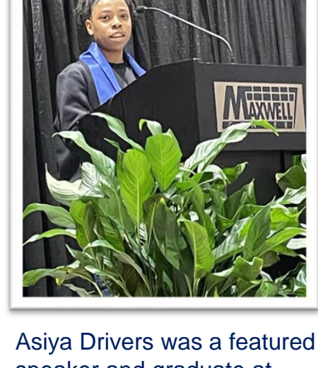
currently completing an internship in the printing field.