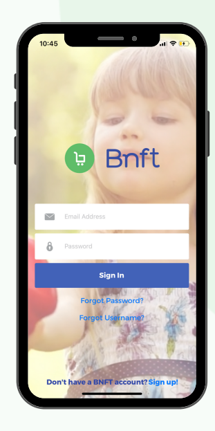
Click Sign up! on the bottom of the home screen.