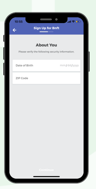
Enter your date of birth in mmddyyyy format and the ZIP code associated with your WIC card.