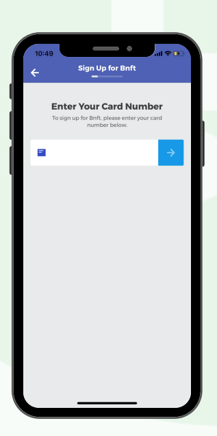
Enter your WIC card number.