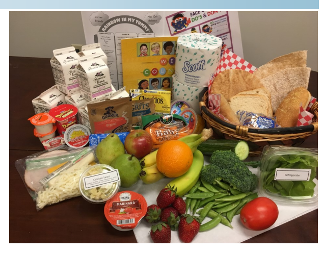
A photo of the beautiful rainbow of foods the Verner Center offers families through their grab-n-qo meal service.

What are the challenges of preparing more than 500 breakfast and lunch meals to go each week? Gunn says that initially there were some supply challenges, like finding enough one gallon Ziploc bags and the right kind of milk to purchase, as well as accommodating