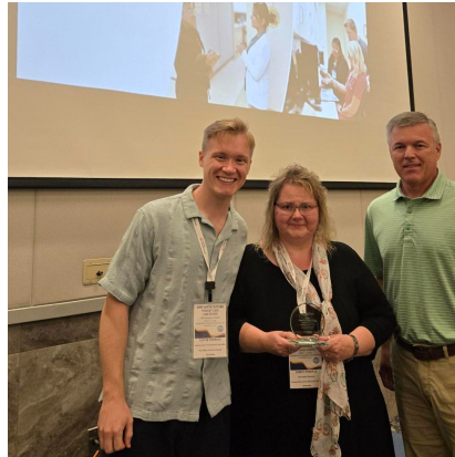
Excellence in Clinical Quality: Community Care Clinic of Franklin

Four organizations and one individual received recognition for their outstanding work this year—awardee photos are below. The panel of awardees shared insights on how they did their excellent work, and we talked about Big Hairy Audacious Goals —What are yours?