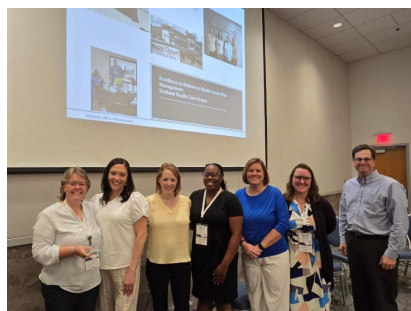
Excellence in Behavioral Access Plan (BHAP) Management: Scotland Health