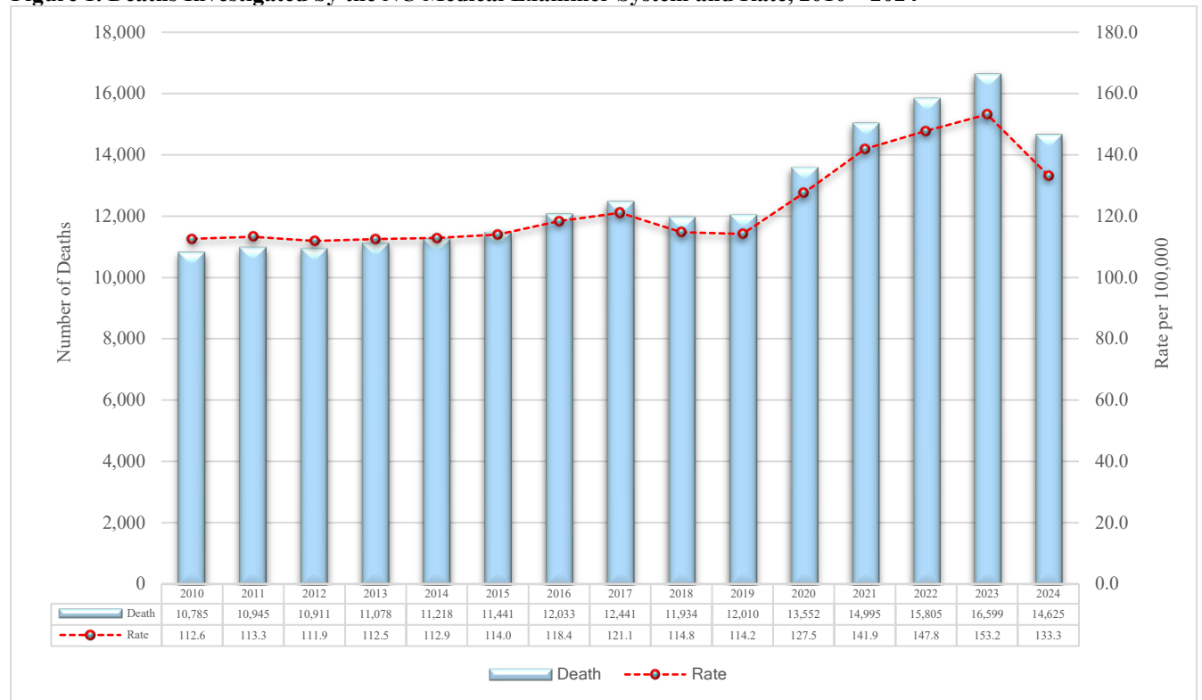
Figure 1. Deaths Investigated by the NC Medical Examiner System and Rate, 2010 – 2024 †

Death investigation data for cases processed by Regional Autopsy Centers and Autopsy Centers are not available in current information technology systems; however, we will be able to track and report these data after the successful system wide launch of our new information technology system.